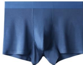
IN THE LAN